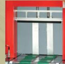
Adjustable Bundle Stops

Provides easy trouble-shooting. With touch panel (HMI) for operating instructions, adjustment, and trouble-shooting guide. User friendly.