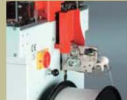
Waist-High Auto Strap Feeding

The table is adjustable to any height between 885 mm and 930 mm.