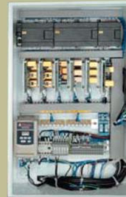
Siemens PLC Control

Friendly design to feed the strap automatically from the upper side of coil without access to the bottom of the machine.