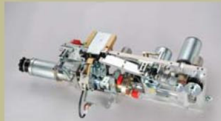
Compact Mechanical Strapping Head

The TP-701N uses latest multi DC brushless motor technology to provide the highest level of accuracy currently available in the strapping machine industry.