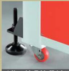
Adjustable Table Height

With 30% fewer this machine parts than comparable strapping machines, this machine requires fewer adjustments, has fewer wear components and requires less maintenance. The simple design of this machine makes maintenance training far easier than previous strapping machines.