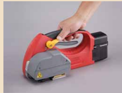
Easy Single-Handed Operation

It is suitable for a wide range of vertical and horizontal strapping applications in all industrial sectors (pallet, construction materials, wood/panel board, paper...etc.)