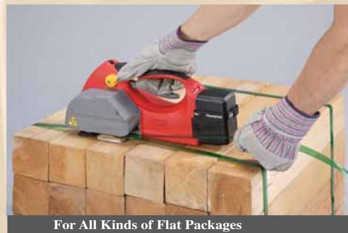
For All Kinds of Flat Packages

It is suitable for a wide range of vertical and horizontal strapping applications in all industrial sectors (pallet, construction materials, wood/panel board, paper...etc.)